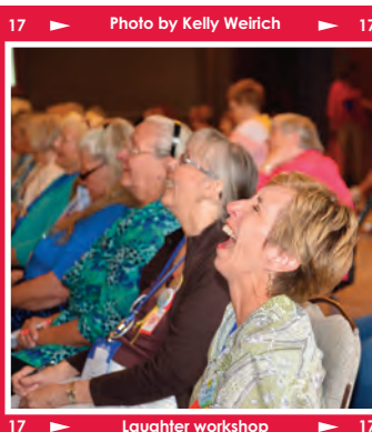
17 ▶ Photo by Kelly Weirich ▶ 17 Laughter workshop ▶ 17