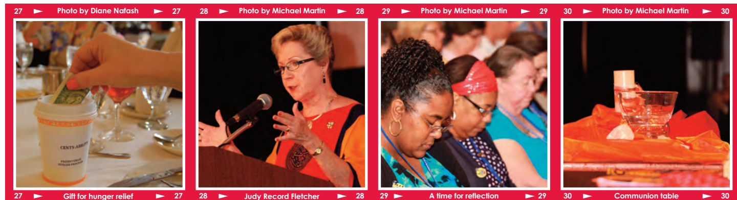
27 ▶ Photo by Diane Nafash ▶ 27

Only gratitude for all the orders for resources requested by Presbyterian women! That being said, please remind anyone who orders to make sure she takes an extra minute or two to ensure that all of the applicable boxes on order forms are considered and completed. The thing is, too many orders for materials are mailed in without shipping charges considered, an expense to the organization that is unnecessary and costly (whether re-billed or absorbed).