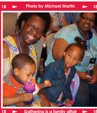
18 ▶ 18 Gathering is a family affair ▶ 18