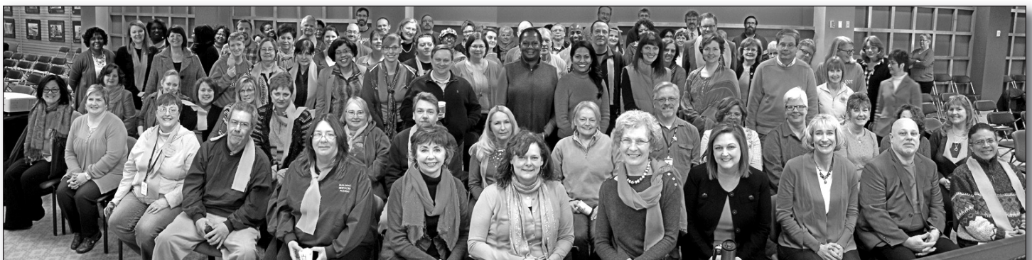
Orange Day was observed at the Presbyterian Center in Louisville, Kentucky, on Friday, January 24, 2014. Everyone in the photo is wearing orange, whether it's a scarf, a sweater or a tie! Orange Days were established by UN Secretary-General Ban Ki-Moon to raise awareness of efforts to end violence against women. PW has been observing Orange Days since early 2013.