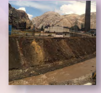
1995 PC(USA) passes "Hazardous Waste, Race, and the Environment" policy