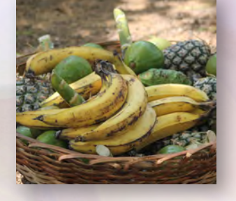
1987 PC(USA) adopts the Common Affirmation on Global Hunger