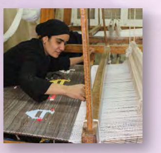
2000 Joining Hands and Enough for Everyone initiatives launch