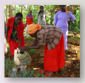
2007 Eco-Palm project & West Africa Initiative launches