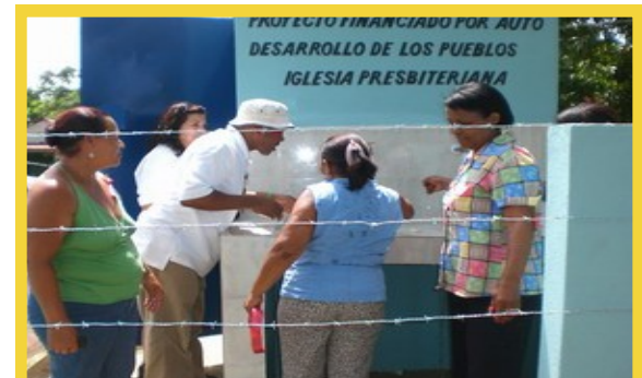
National Committee member during opening ceremony of water system in a community in the Dominican Republic

The National Committee meets three times a year (January, May and September). Task Forces meet in conjunction with the National Committee and between each National meeting. Standing Committees meet in conjunction with National Committee meetings. Each member is assigned to serve on a regional Task Force, and Standing Committee (Community Relations, Church-wide Relations, Personnel) or the International Task Force. The Community Relations, Church-wide Relations, and Personnel Committees rarely meet outside of the National Committee meetings. The International Task Force meeting schedule is similar to other Task Forces. Committee members are responsible for conducting site visits to potential partners in the United States, conducting training sessions for Synod/Presbytery SDOP Committees and leading workshops for community groups.