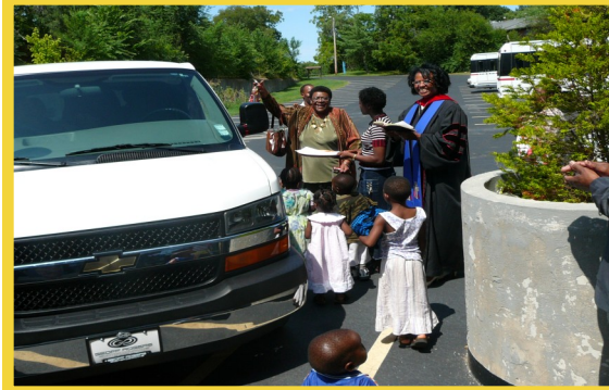
National Committee member visiting a transportation project in St. Louis, MO