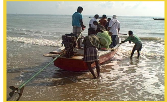
National Committee member visiting a fishermen's project in India.

The National Committee meets three times a year (January, May and September). Task Forces meet in conjunction with the National Committee and between each National meeting. Standing Committees meet in conjunction with National Committee meetings. Each member is assigned to serve on a regional Task Force, and Standing Committee (Community Relations, Church-wide Relations, Personnel) or the International Task Force. The Community Relations, Church-wide Relations, and Personnel Committees rarely meet outside of the National Committee meetings. The International Task Force meeting schedule is similar to other Task Forces. Committee members are responsible for conducting site visits to potential partners in the United States, conducting training sessions for Synod/Presbytery SDOP Committees and leading workshops for community groups.