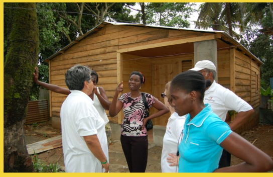
National Committee members visiting a Batey in Dominican Republic

Being a part of this ministry provides an opportunity to positively impact the lives of economically poor, oppressed, and disadvantaged people around the world. We hope you will consider serving on the National Committee. If you, or someone that you know would be interested, please visit (or encourage them to visit) the General Assembly Nominating Committee (GANC) website www.pcusa.org/nominations for the nominating form. Interested individuals must complete this form and submit it to the GANC. Check with GANC for deadlines.