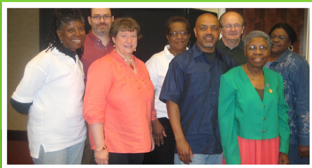
National Committee, Task Force and Standing Committee Chairpersons

Self-Development of People is a ministry that affirms God's concern for humankind. We are Presbyterians and ecumenical partners, dissatisfied with poverty and oppression, united in faith and action through sharing, confronting and enabling. We participate in the empowerment of economically poor, oppressed and disadvantaged people who are seeking to change the structures that perpetuate poverty, oppression and injustice.