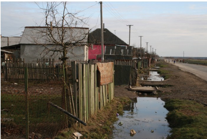
A Roma village in Carpath-Ukraine.