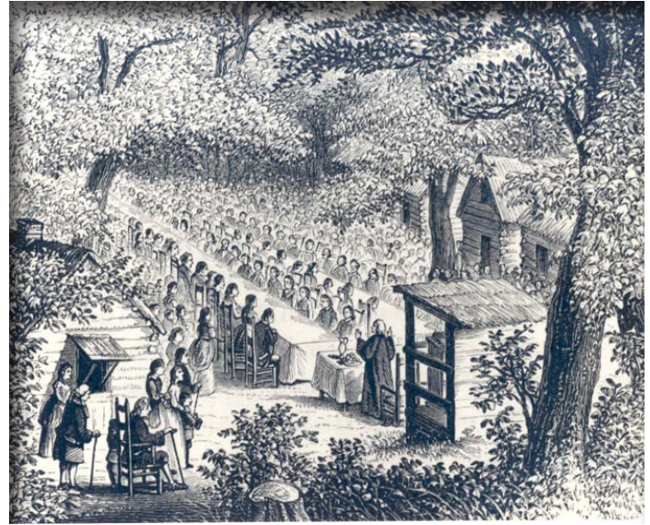
A Communion Gathering in the Olden Time.

Communion tokens were a familiar feature of Presbyterian worship in past centuries. The practice was brought to colonial America from Scotland. Most colonial congregations celebrated the Lord's Supper once or twice a year. A day or more before the communion service, the pastor and elders questioned the members of their congregation about their beliefs and behavior. Only those who showed adequate knowledge of the faith and were deemed to be living upright lives received tokens. During the communion service, communicants came forward and sat at long tables where they turned in their tokens and received the elements.