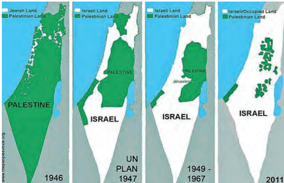
Figure 1: Maps showing the evolution of Palestine and Israel