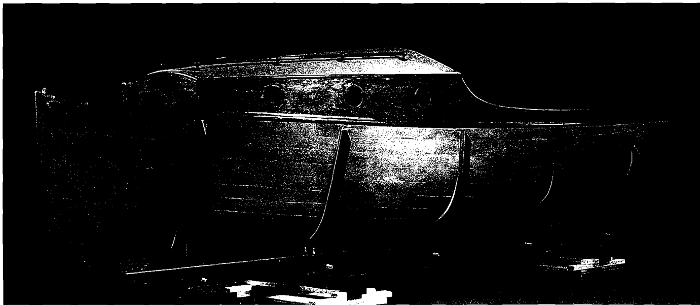
Danish motorboat used in the Danish rescue, Denmark, ca. 1930s and 1940s.

Another difficult theological issue arises when Christians try to understand the relationship of the Holocaust to the land and state of Israel. Many Jewish thinkers have seen the creation of