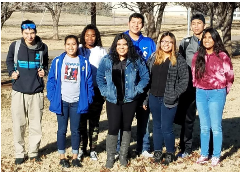
American Indian Youth Council Class of 2021