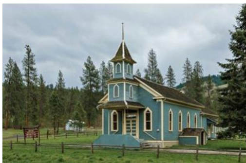
First Indian Presbyterian Church Kamiah, Idaho est. 1871 (Nez Perce Indian reservation)

Very few ordained Native American clergy still serve these congregations. The churches are dependent upon Commissioned Ruling Elders because they cannot meet the presbytery minimum salary necessary to pay a full-time pastor. Most of these congregations are comprised of low-income Native people so consequently do not have the resources to sustain full-time ministries. The loss of national and mid-governing body mission funding has contributed to an already acute leadership crisis in these churches.