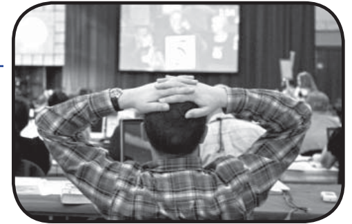
Commissioners spent long hours studying, discussing and praying about important issues before them.

And the Assembly asked the Presbyterian Mission Agency to provide “basic accessibility of essential GAMC information to major non-English language groups, specifically Korean and Spanish.