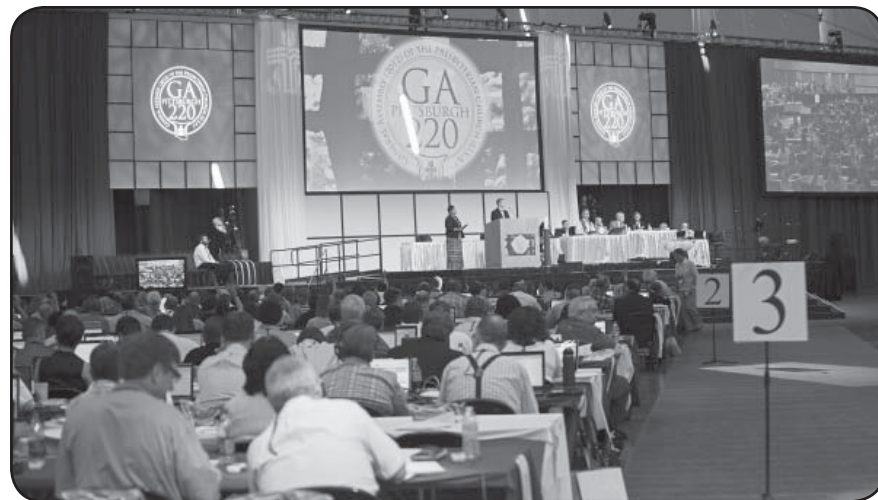
The Assembly Hall for the 220th GA.