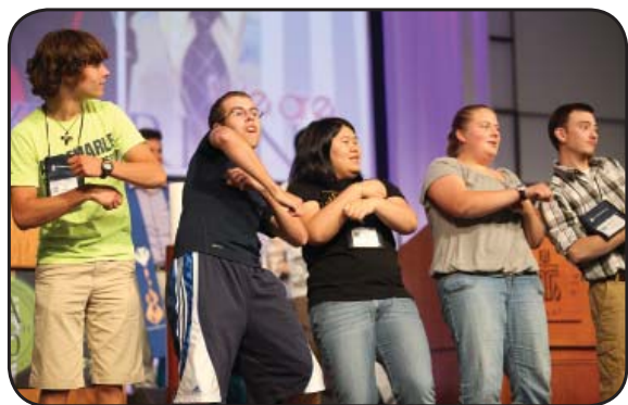
Young Adult Advisory Delegates lead an energizer on Thursday night.

The Assembly also adopted a statement that “acknowledges that faithful Presbyterians earnestly seeking to follow Jesus Christ hold different views about what the Scriptures teach concerning the morality of committed, same-gender relationships” and that “the Presbyterian Church (U.S.A.) does not have one interpretation of Scripture in this matter.”