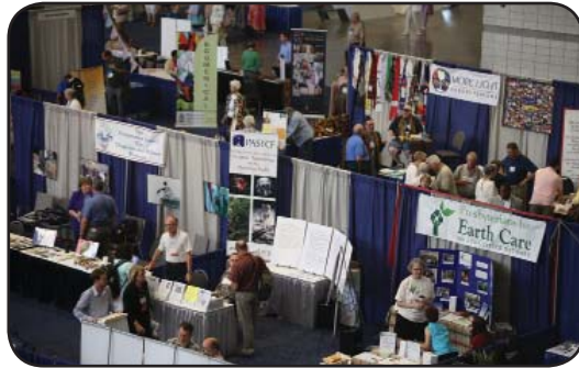
A sample of the variety of booths featured in the 220th GA Exhibit Hall.