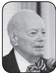
Wendell Freeman, a Tuskegee Airman and bombardier, addressed the National Black Presbyterian Caucus Dinner.

Also on recommendation of its Assembly Committee on Confessions of the Church, the Assembly voted 395-264 to initiate the study process that could lead to the inclusion of the Belhar Confession in the PC(USA)'s The Book of Confessions . The Assembly in 2010 took the same action, but Belhar fell eight votes short of the required two-thirds affirmative vote by the presbyteries. The Assembly action included funds for education across the church about the confession, which was developed by South African theologians in the 1980s as their response to the sin of racism and the practice of apartheid in that country.