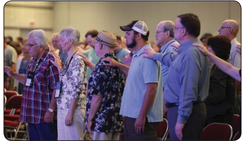
220th GA commissioners and advisory delegates pray during the GA Breakfast on Monday morning.