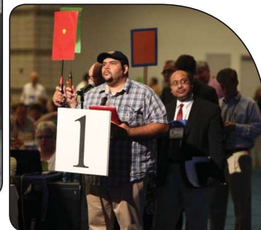
Commissioners and advisory delegates line up to debate.