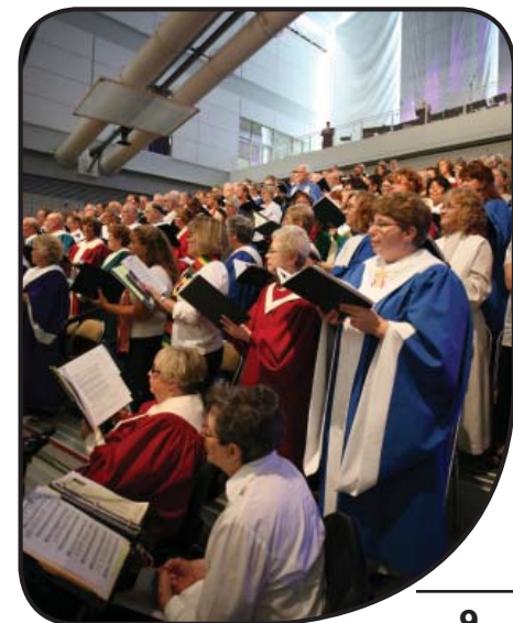
Combined mass choir provides glorious music during the opening worship for the 220 th General Assembly.