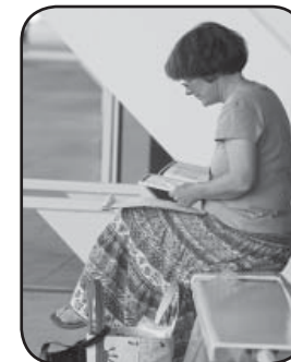
Commissioners stayed busy throughout the day studying materials.