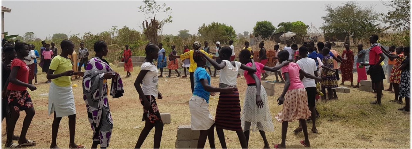
Girls from the Kasire II PCOSS church community gather to embrace their self-worth and support each other.