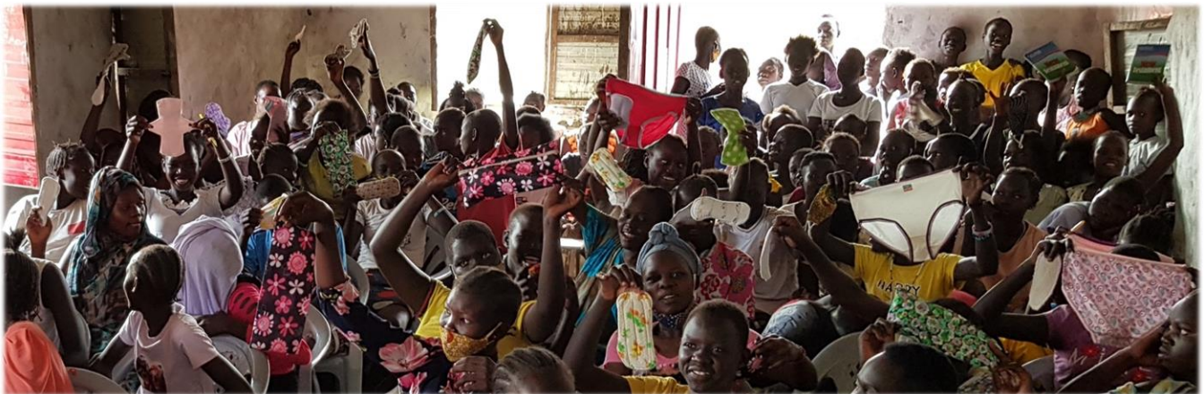
PCOSS girls excited to receive dignity/hygiene kits from PC(USA) friends

They sought to develop a “sisterhood of acceptance,” accepting themselves and others. They are learning to advocate for change and to address the social and cultural norms (early marriage, devaluation of a girl's worth, isolation during menstrual cycle, gender-based violence, etc.) that prevent girls from reaching their full potential. They are gaining skills as peer counselors and also learning the importance of serving as role models in the community.