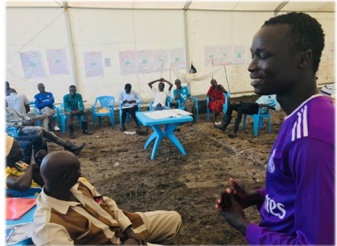
Across facilitating a training inside their rub hall in Pibor.

We have reached a point where Across has its own compound with two rub halls [big storage areas]. Any food [assistance] taken to Pibor, is put in the Across compound... We have a compound, a Land Cruiser, a team with support from Help a Child Netherlands, a food security officer, and a manager who supports the work from Juba. Across has purchased motorboats to support programs during the rainy season, to try to access the people. We have support funding from the EU [European Union] for technical/professional training... We have a strong presence. Across is well appreciated by the Pibor Administrative Area."