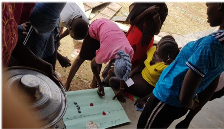
The Presbyterian Church in Kasire II in Juba continues to encourage girls in their spiritual and educational formation