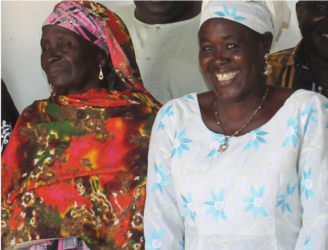
Local community members of one of the grain banks that RELUFA has helped to establish.