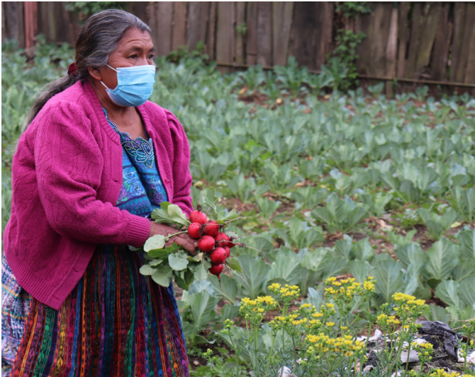
A woman in San Juan Ostuncalco harvests radishes for the seed project.