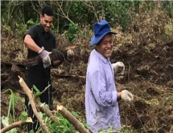
The PCC promotes gardens of peace, eco-farms and other ecologically centered models.