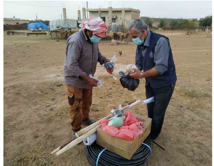
The MECC's Diakonia Department distributes seeds to farmers in Syria.