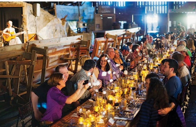
A New Worshipping Community primarily gathering people in the service industry gathers for a meal as part of their worship in Spokane, WA.

Each level of the Church; congregation, mid council, and Mission Agency have unique opportunities to live out the call of Christ. Gifts to Shared Mission, given without restrictions, grow your congregation's impact, providing the essential support and flexibility for mid councils and the Presbyterian Mission Agency to engage in ministries that partner in God's mission.