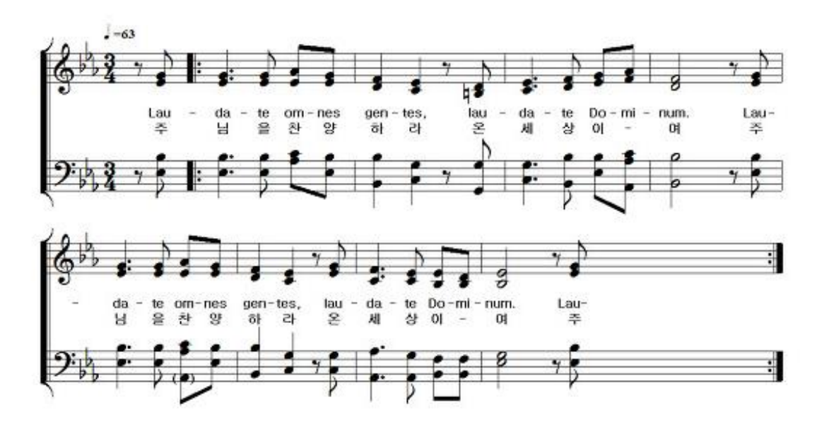
{Hearing the Word}