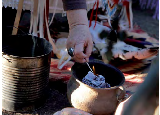
Copy of the Doctrine of Discovery being burned during the clergy march on Standing Rock.

In 2016, the Standing Rock Sioux Tribe galvanized an unprecedented movement for solidarity to protect their sacred land when Energy Transfer Partners undertook construction of the Dakota Access Pipeline. The Dakota Access Pipeline crosses un-ceded treaty lands, desecrates a Sioux burial ground, and crosses under the Missouri River. In seeking to protect sacred lands and waters, peaceful, prayerful camps with tens of thousands of people formed surrounding pipeline construction sites. Tribal and religious leaders from around the world visited the camp. In November 2016 at Standing Rock, more than 500 religious lead-