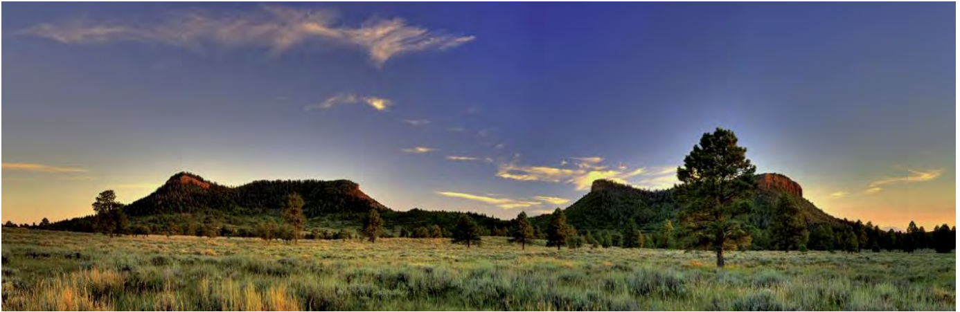
Bears Ears National Monument.