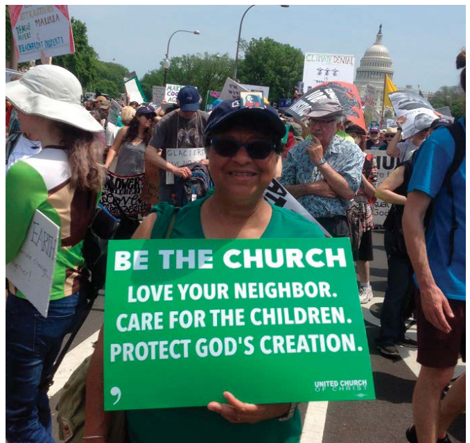
2017 Climate March in Washington, DC.