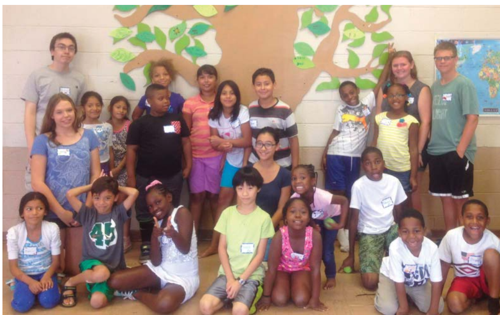
Creation-themed arts camp at Community Reformed Church, Manhasset, NY.

At camps across the country, youth are learning to love and care for the earth through gardening and animal husbandry. By playing alongside chickens, feeding pigs compost, harvesting carrots for a campout meal, and collecting eggs for breakfast they inherently build relationships with the land and the Creator. These lessons carry on into adulthood.