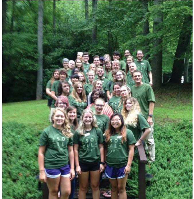
Youth at SOIL Conference.

The reason Camp Stevens, an Episcopal camp in Southern California, started a recycling and compost program is because of young people. These young people saw a gap in opportunity and sustainability, developed the ideas into a system and a program, and then rallied the camp leadership to make it happen. Today, children collect chicken eggs, sift compost, plant and harvest produce, and eat camp out meals from re-used kitchen containers because of the courage and ingenuity of their peers!