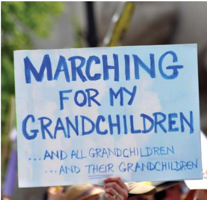
Climate March 2017.