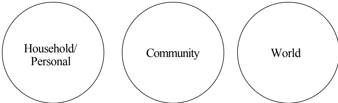
Diagram 2: This is what your poster for Activity 1d) might look like. This poster will be used several times during the course.

Diagram 1: This is what your blackboard might look like during Activity 1, a-c. (The finished diagram should show little sticky notes clustered around the 3 circles also.)