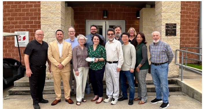
The MES team met with leaders of the Presbyterian Pan American School in Kingsville, Texas. PPAS is one of the recipients of the Christmas Joy Offering.