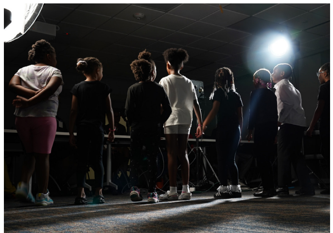
Young people learned about video production during the Upcoming Storytellers camp.