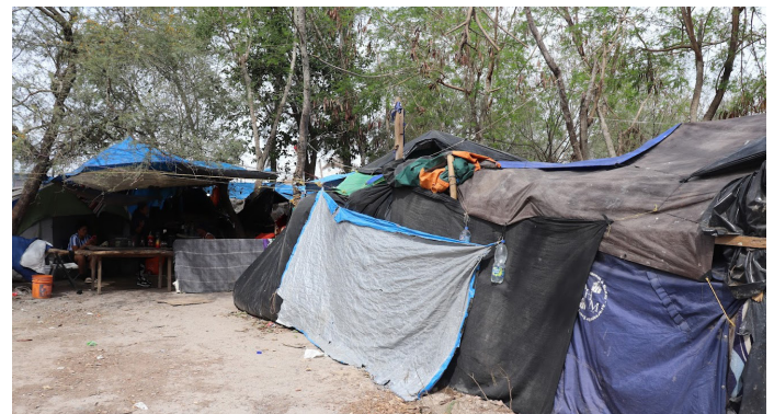
In February, the MES team travelled to south Texas. They crossed the border into Matamoros, Mexico for a day to visit an immigrant site.