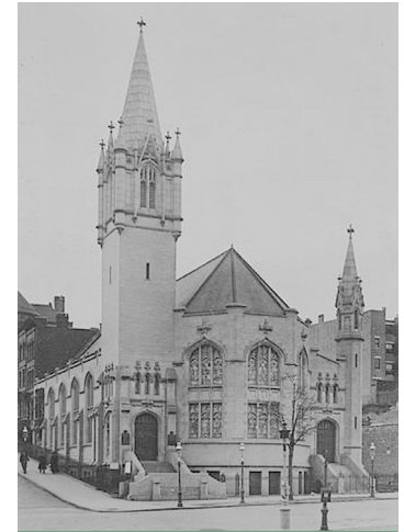
St. James moved several times before settling into its current location at 141st St and St. Nicholas Ave in 1927.