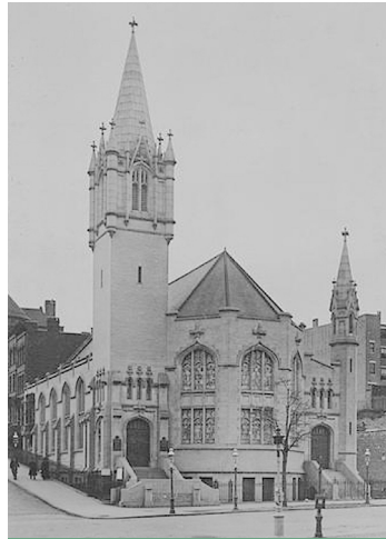
St. James moved several times before settling into its current location at 141st St and St. Nicholas Ave in 1927.