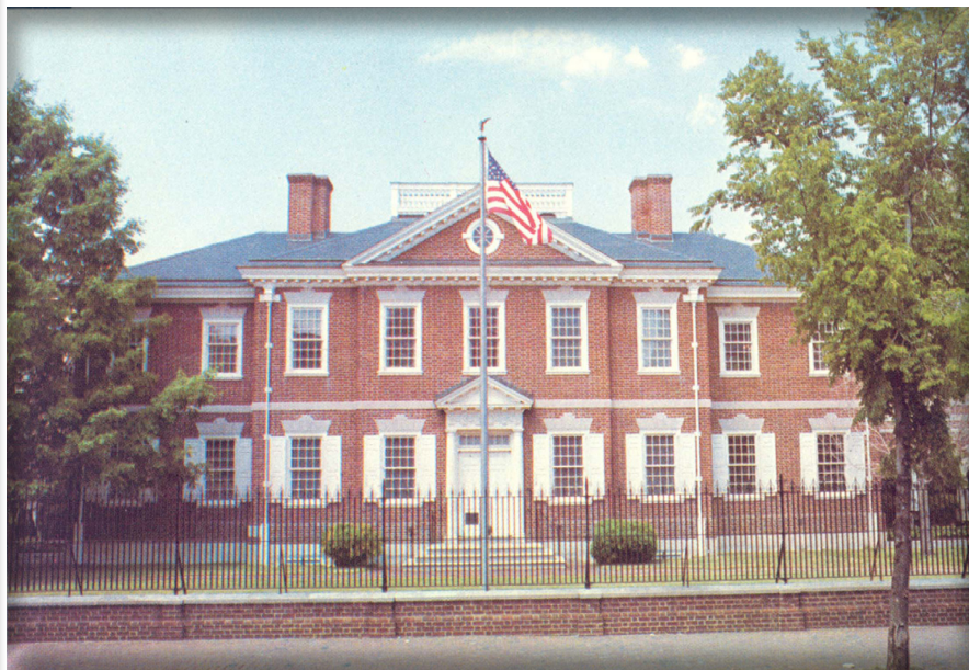
Current home of the Presbyterian Historical Society in Philadelphia.