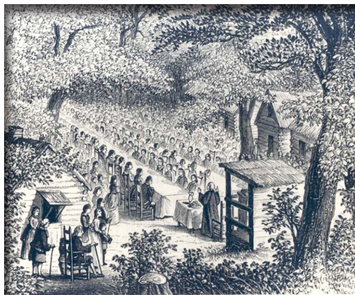
A Communion Gathering in the Olden Time.

Communion tokens were a familiar feature of Presbyterian worship in past centuries. The practice was brought to colonial America from Scotland. Most colonial congregations celebrated the Lord's Supper once or twice a year. A day or more before the communion service, the pastor and elders questioned the members of their congregation about their beliefs and behavior. Only those who showed adequate knowledge of the faith and were deemed to be living upright lives received tokens. During the communion service, communicants came forward and sat at long tables where they turned in their tokens and received the elements.